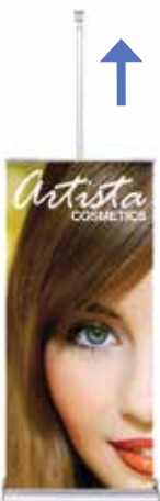
a. Pull banner out of base