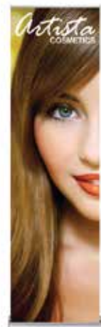
c. Complete stand