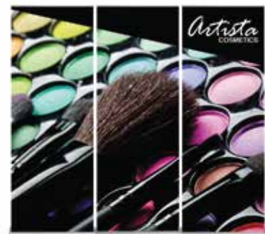
Silverstep Magnetic Connector