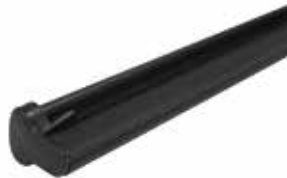
Black Clamp Bar (Optional for Super Flat Vinyl)