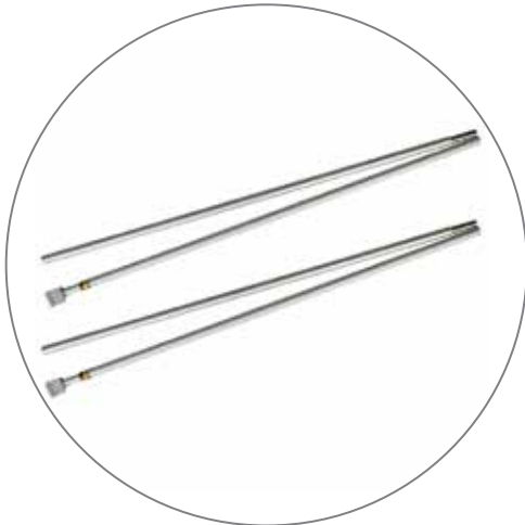
Qty 2 - Telescopic Support Poles