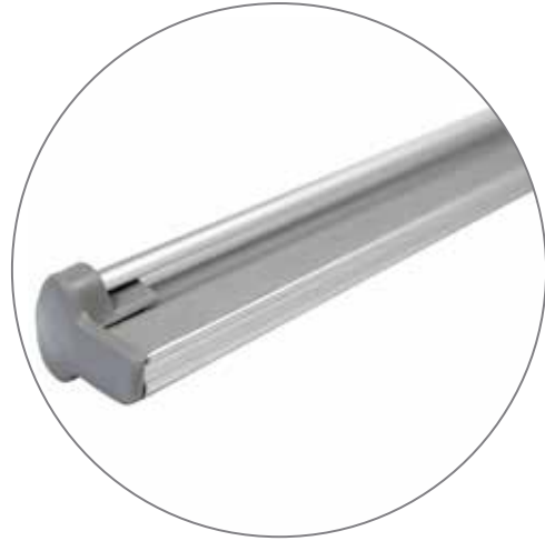
Qty 1 - Clamp Bar