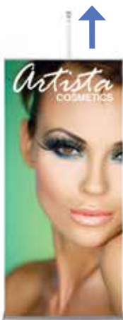
a. Pull banner out of base