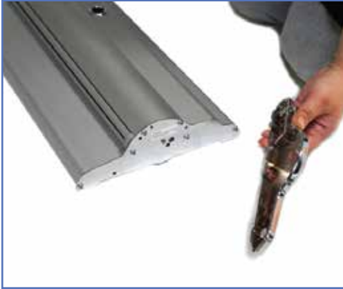
a. Pull off end caps from Silverstep