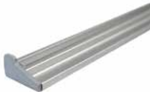
Silver Hook & Loop Bar (Optional for Fabric)