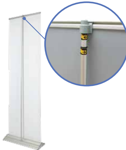
b. Attach telescopic poles to the clamp bar Adjust pole to desired height.