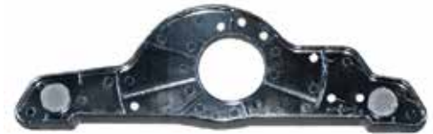
Silverstep Magnetic Connector (Optional)