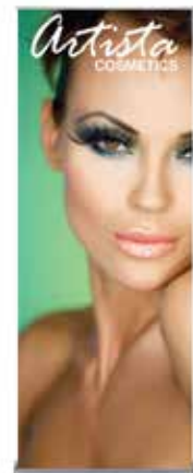
c. Complete stand