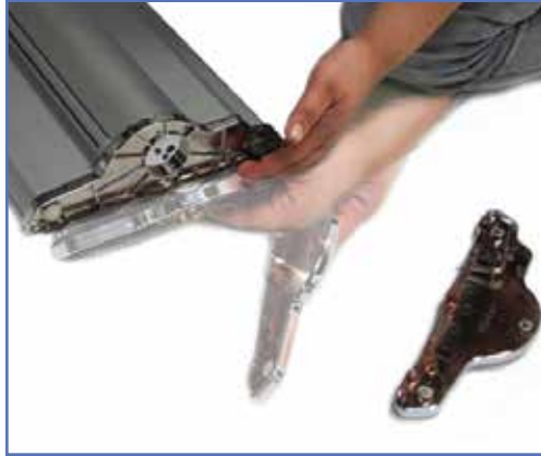
b. Push connector piece until it locks in position