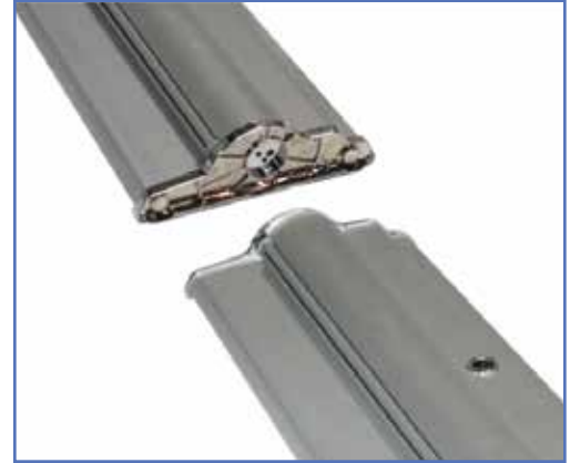
c. Connect another Silverstep onto it