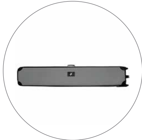
Qty 1 - Silver Travel Bag