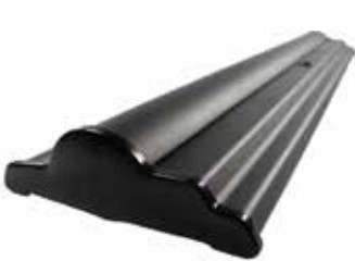
Black Base (Optional)