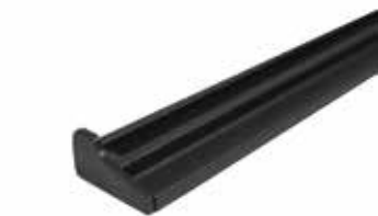
Black Hook & Loop Bar (Optional for Fabric)