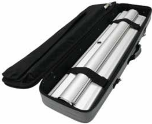
a. Remove Silverstep Stand out of bag