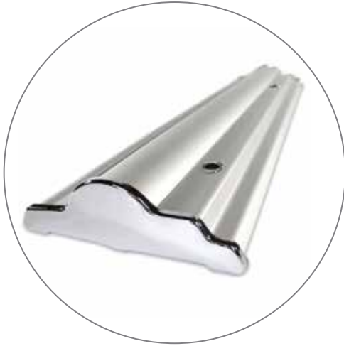
Qty 1 - Silverstep Stand