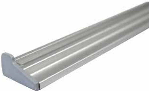
Silver Hook & Loop Bar (Optional for Fabric)