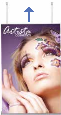
a. Pull banner out of base