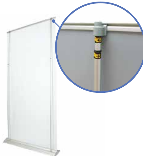
b. Attach telescopic poles to the clamp bar Adjust pole to desired height.