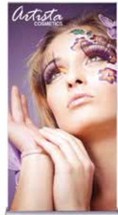
c. Complete stand