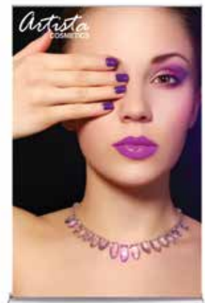
c. Complete stand