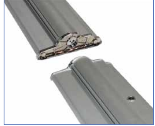
c. Connect another Silverstep onto it