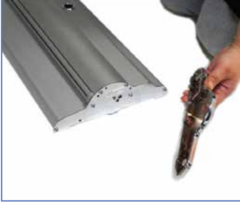
a. Pull off end caps from Silverstep