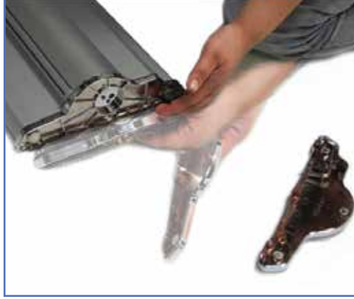
b. Push connector piece until it locks in position