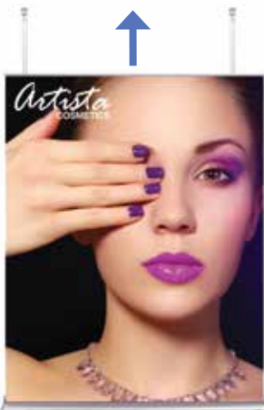
a. Pull banner out of base